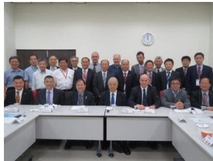
ISIC Summit Meeting of Regional Representatives

Blayson were both exhibiting and presenting, with papers given covering market reviews of North America and Europe and a technical paper on the ‘Characteristics and Control of Investment Casting Wax’.